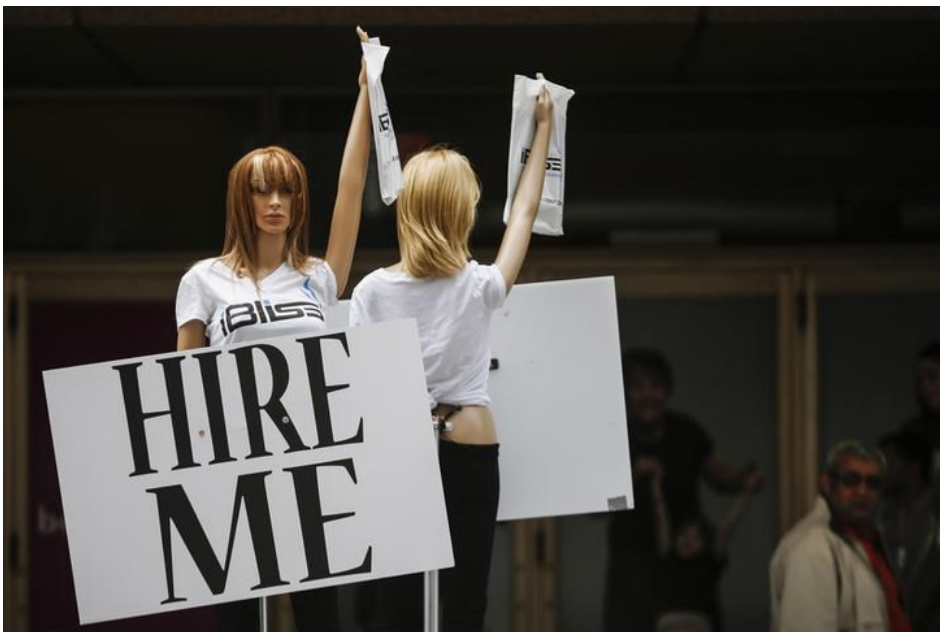
A file photo of motorized mannequins holding signs that read "Hire Me" in Toronto, May 23, 2014.