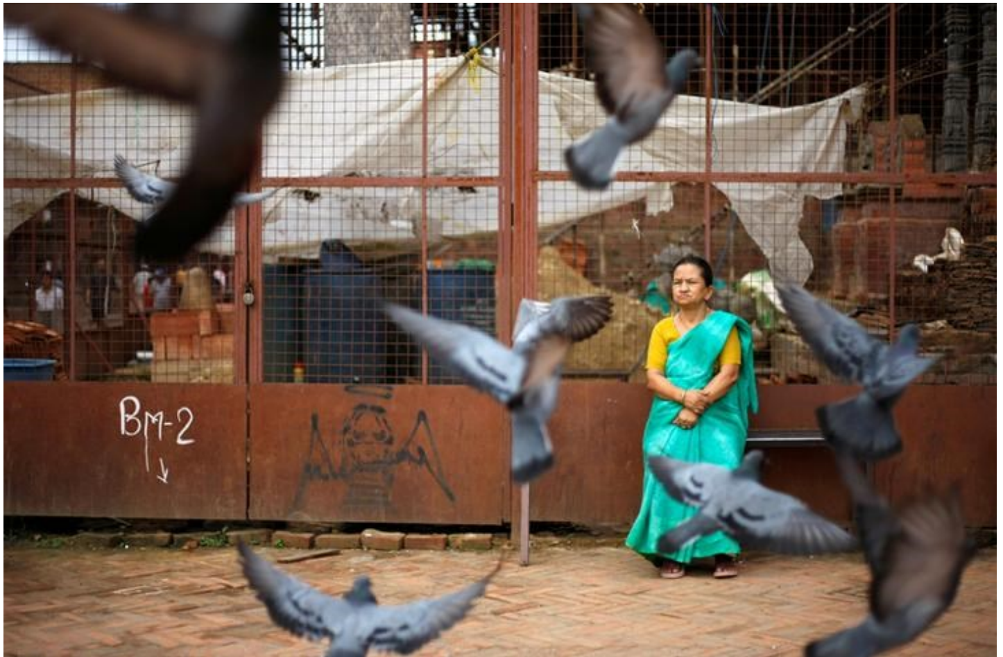
A woman sits on a chair as pigeons fly in Lalitpur, Nepal, July 5, 2019.