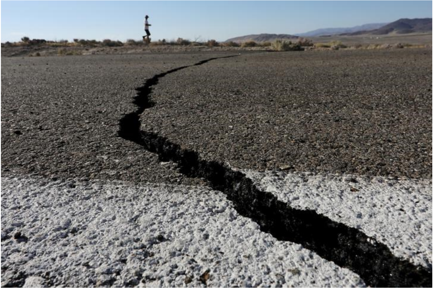
Fissures that opened up under a highway during a powerful earthquake that struck Southern California are seen near the city of Ridgecrest, California, July 4.

The Financial and Risk business of Thomson Reuters is now Refinitiv.