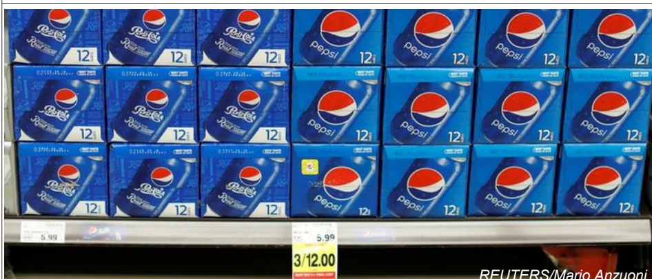
A file photo shows cans of Pepsi at a grocery store in Pasadena, California, July 11, 2017.

PepsiCo Inc is expected to report its second-quarter results on Tuesday. Growing demand for healthy snacks and beverages is expected to boost sales in the quarter. Investors will keep