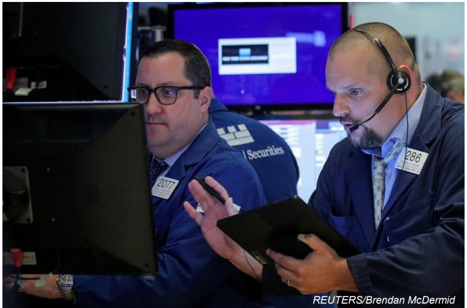
Traders work on the floor at the New York Stock Exchange in New York, July 1.

The dollar gained against a basket of currencies to its highest levels in 2-1/2 weeks after data showed that U.S. job growth rebounded strongly in June. "You look at the U.S. number for today