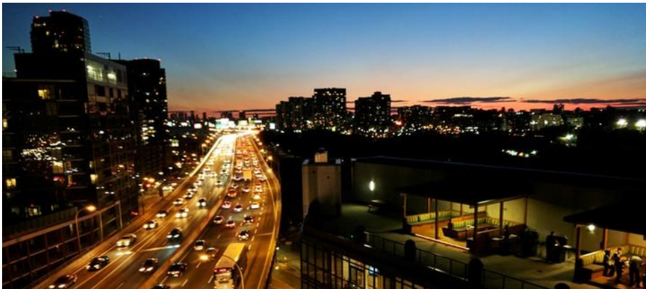
A file photo of Condo buildings on both sides of Gardiner Expressway in downtown Toronto, Ontario, on August 31, 2017.