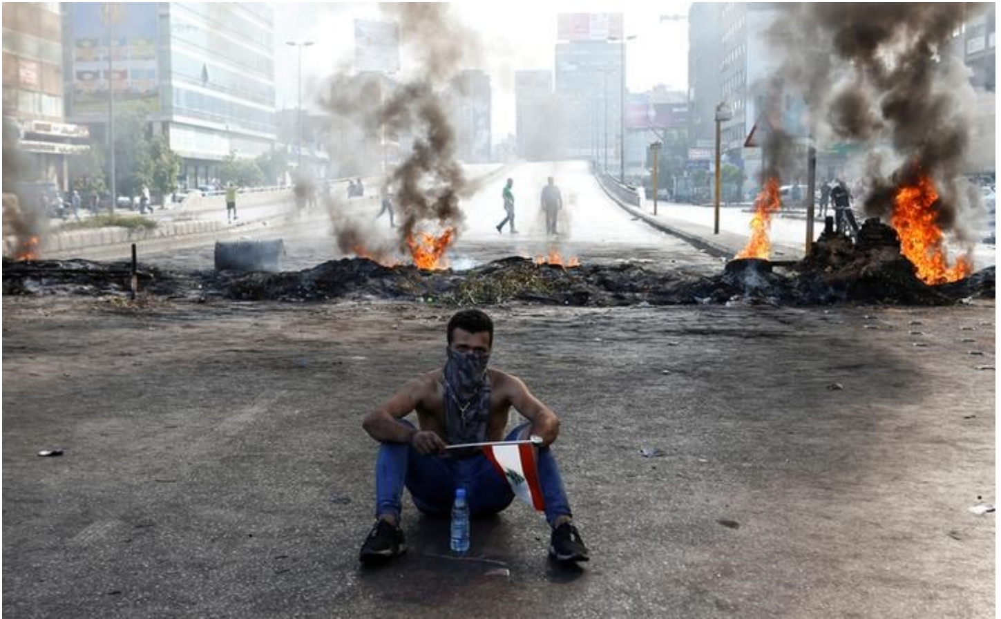
A demonstrator sits near burning tires as he holds a Lebanese flag during a protest over the deteriorating economic situation, in Dora, Lebanon, October 18.