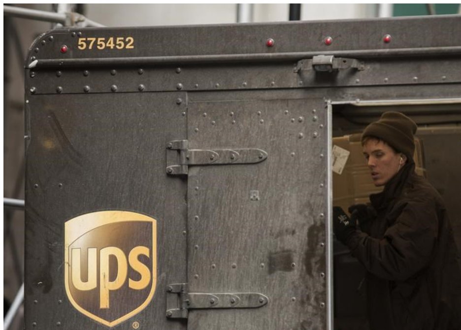
A file photo of a UPS delivery person offloading packages from a truck in New York's financial district, March 5, 2014.

One Brands and the potential full-year earnings outlook revision in light of recent price hikes.