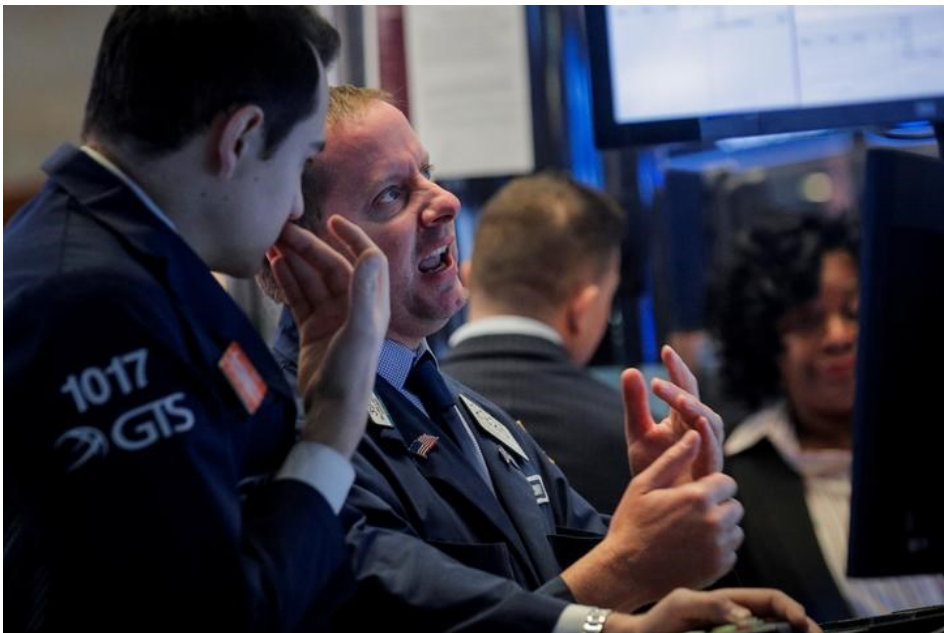
Traders work on the floor at the New York Stock Exchange, October 18.

The dollar fell sharply against the euro as the common currency jumped on hopes that a Brexit deal between