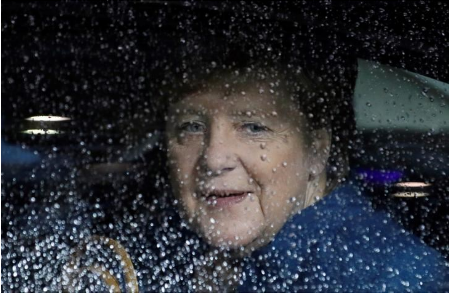
German Chancellor Angela Merkel looks out of her car window as she arrives for the second day of the European Union leaders summit dominated by Brexit, in Brussels, Belgium, October 18.

The Financial and Risk business of Thomson Reuters is now Refinitiv.