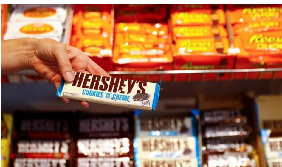
A file photo of an employee showing a Hershey's chocolate bar made in USA in the "American lifestyle" store in Berlin, Germany, August 13, 2018.

Hershey Co is likely to report a rise in third-quarter sales on Thursday, helped by price hikes and higher demand in North America. Investors will be looking for the company's comments on the impact of new acquisitions such as