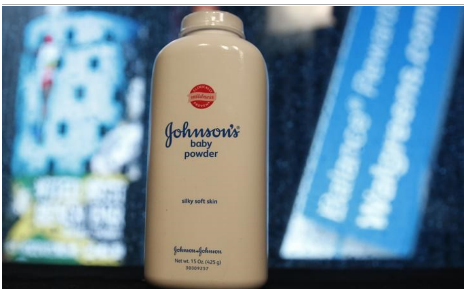
A file photo of the bottle of Johnson and Johnson Baby Powder is seen in a photo illustration taken in New York, February 24, 2016.

Oracle co-Chief Executive Officer Mark Hurd has died, the business software maker said, an unexpected development that raises pressure on co-CEO Safra Catz to lead the company's ongoing transition to cloud computing. Hurd, 62, went on medical leave last month, with Catz and founder Larry Ellison taking over his responsibilities during his absence. The company did not provide any further details at the time. Hurd and Catz were named co-CEOs in 2014, after Ellison decided to step aside to focus on his role as chief